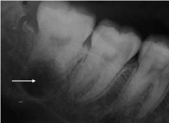
Fig. 2: Periapical radiograph showing a sharply delineated radiolucent lesion epicentered around the furcation area in relation to the left mandibular third molar (straight arrow); preservation of the follicular space is also appreciated (curved arrow) (Courtesy: Diagnostic features of the paradental cyst and report of a case. Dentomaxillofacial Radiology 2009;38:125-126)